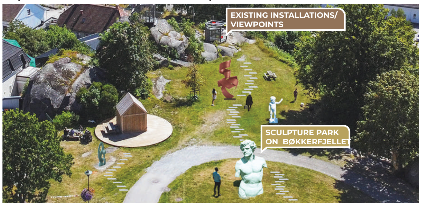
Program: Upon reaching the summit of Bøkkerfjellet, the visitor is greeted by a sculpture park that complements the existing wooden art installations that provide panoramic views of the city.