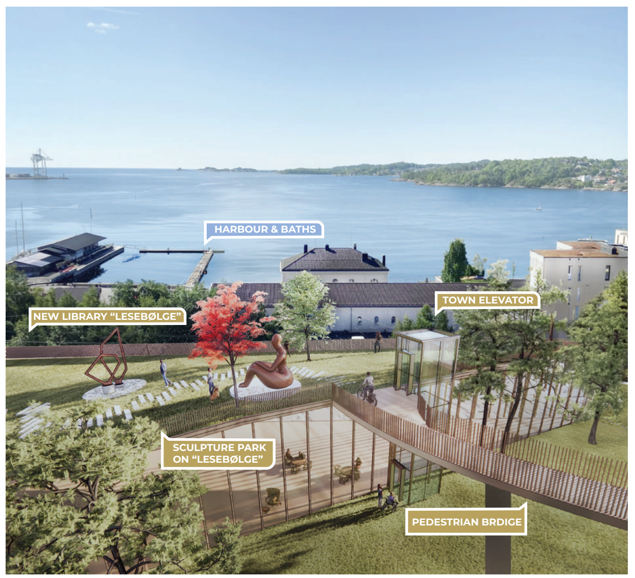
Program: pedestrian and bicycle bridge connecting the top of Bøkkerfjellet to the rooftop of the new library, spanning across hard barriers such as railway .lines and busy main roads