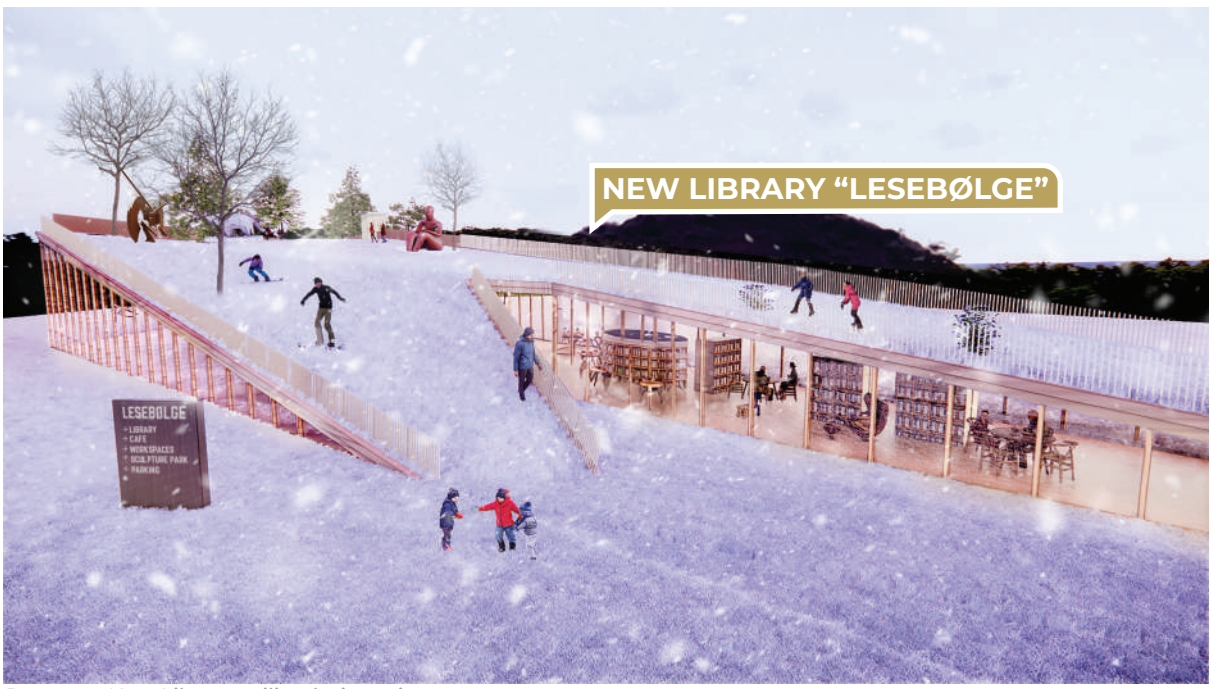
Program: New Library utility during winter

Moreover, adaptive reuse will play a pivotal role in the project. Existing buildings in the area such the Tollboden building will be gradually transformed into art galleries and studios for woodworking and carpentry. This innovative repurposing not only breathes new life into underutilized spaces but also fosters creativity and cultural exchange, drawing more people to engage with the artistic community. Throughout the implementation process, community engagement and participation will be actively sought. Local residents will have opportunities to provide feedback, share ideas, and actively contribute to shaping the final outcome. Town hall meetings, workshops, and online platforms will be used to facilitate open communication channels, ensuring that the project aligns with the desires and aspirations of the community.