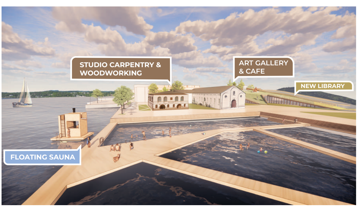
Program: Harbour and baths on Larvik's waterfront