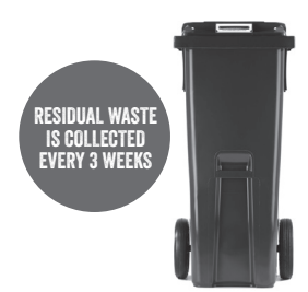
Do you have too much residual waste? In that case, you can buy additional bags or order larger bins for a higher fee. Contact us for more information.