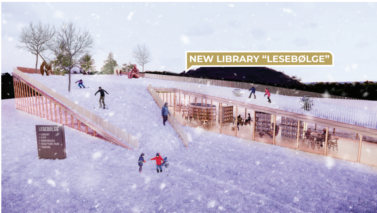
Program: New Library utility during winter

Moreover, adaptive reuse will play a pivotal role in the project. Existing buildings in the area such the Tollboden building will be gradually transformed into art galleries and studios for woodworking and carpentry. This innovative repurposing not only breathes new life into underutilized spaces but also fosters creativity and cultural exchange, drawing more people to engage with the artistic community. Throughout the implementation process, community engagement and participation will be actively sought. Local residents will have opportunities to provide feedback, share ideas, and actively contribute to shaping the final outcome. Town hall meetings, workshops, and online platforms will be used to facilitate open communication channels, ensuring that the project aligns with the desires and aspirations of the community.