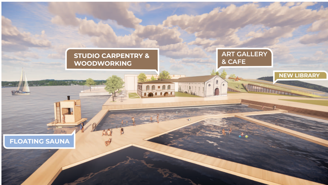
Program: Harbour and baths on Larvik's waterfront